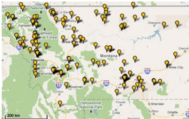
Summer Food sites across the state!