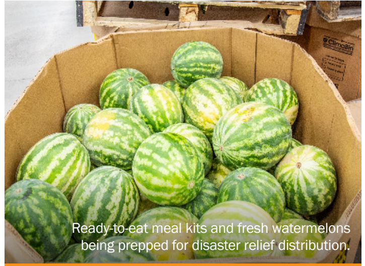
Ready-to-eat meal kits and fresh watermelons being prepped for disaster relief distribution.