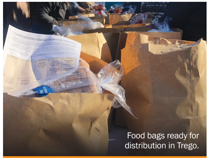
Food bags ready for distribution in Trego.