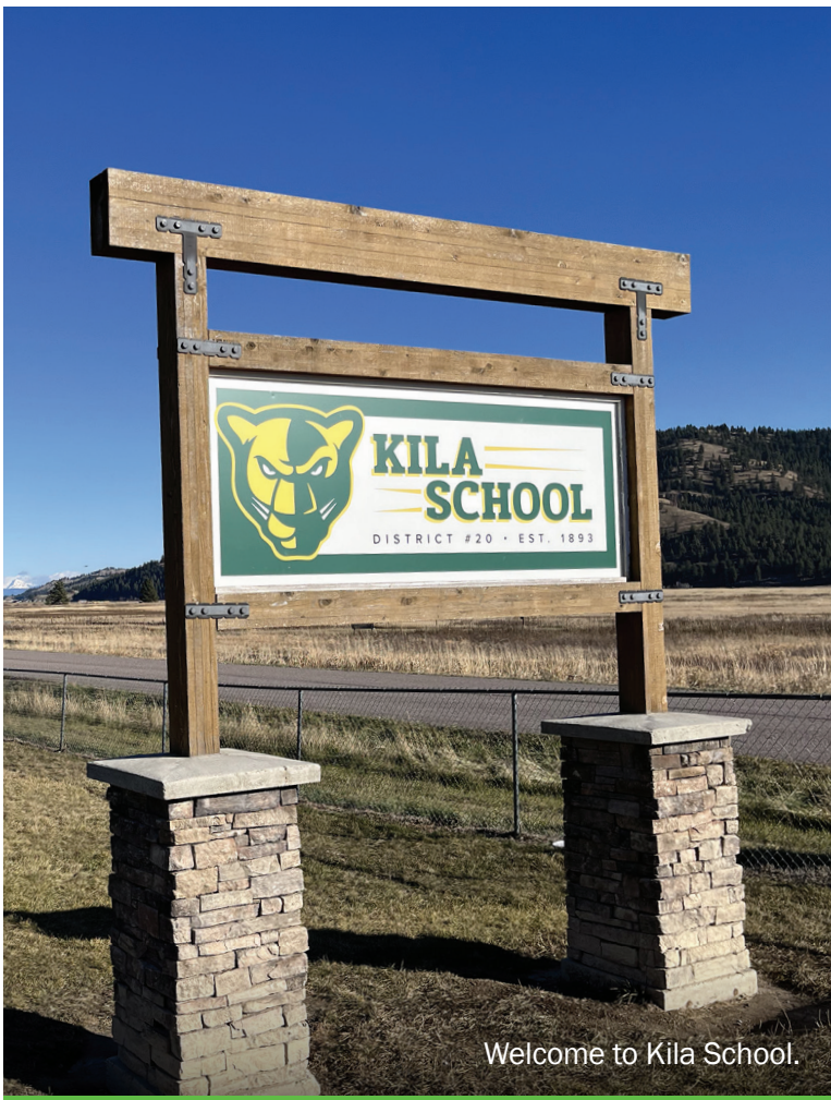
Welcome to Kila School.

To learn more about NKH Montana, visit us at mfbn.org/no-kid-hungry-montana .