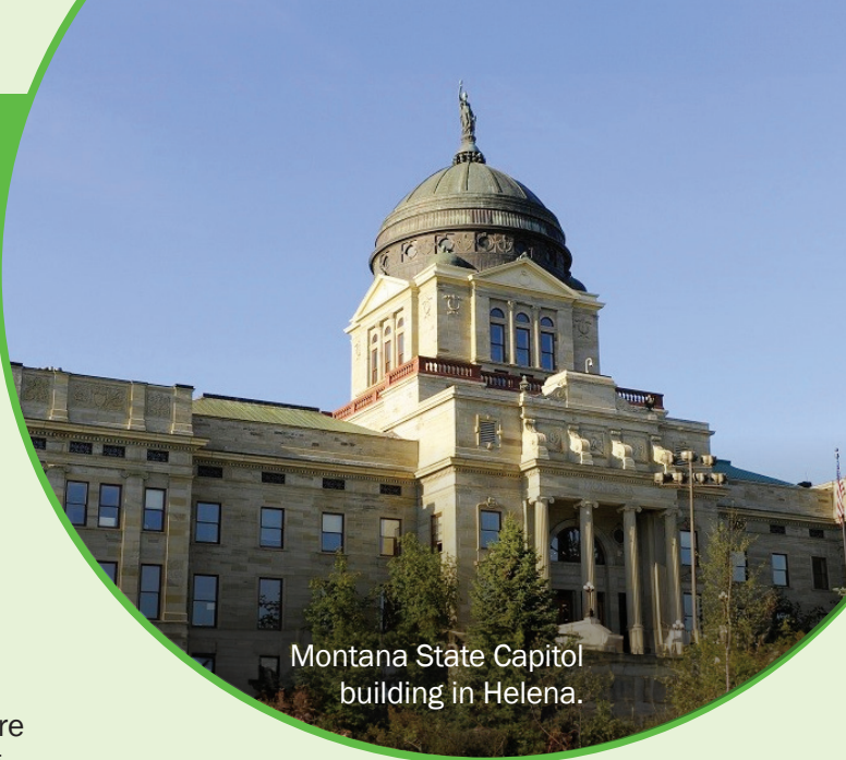
Montana State Capitol building in Helena.

2024 is an important year for nutrition policy. This year, Congress must pass a Farm Bill reauthorizing the agriculture policies that shape our country's food system, as well as programs impacting access to food, including SNAP and USDA commodity programs. Additionally, states will begin implementing Summer EBT — a new, nationwide child nutrition program to reduce child hunger over the summer months.