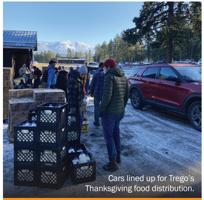
Cars lined up for Trego’s Thanksgiving food distribution.

As our understanding of equitable access to nutritious food as a basic human right grows, we see more examples of our network pulling together, combining strength, and bringing necessary resources where they are needed most. Thanks to everyone who works towards a hunger-free Montana every Friday in Trego and in small communities everywhere.