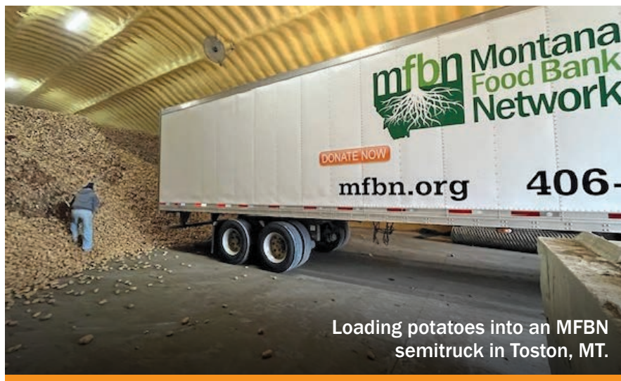
Loading potatoes into an MFBN semitruck in Toston, MT.

MFBN jumped on the opportunity to help a local Montana farmer distribute 160,000 pounds of fresh, surplus potatoes before they spoiled and went to waste. However, saving half a million servings of spuds is no easy task! Due to the amount of potatoes, their need to be washed and packaged, and the short window of time before spoilage, no Montana food bank facility could accept and process the potatoes. Instead of giving up and leaving the farmer in a bind, we collaborated with our partners Feeding America and Feeding the Northwest to move four semitruck loads of potatoes from Toston, MT to El Pasoans Fighting Hunger Food Bank in El Paso, TX.