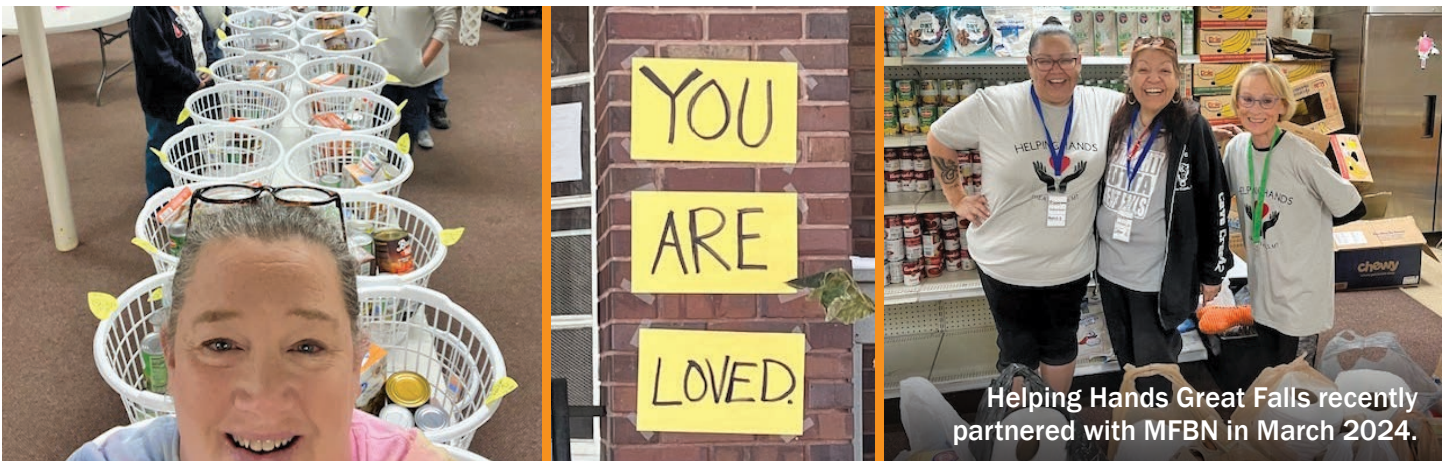
Helping Hands Great Falls recently partnered with MFBN in March 2024.