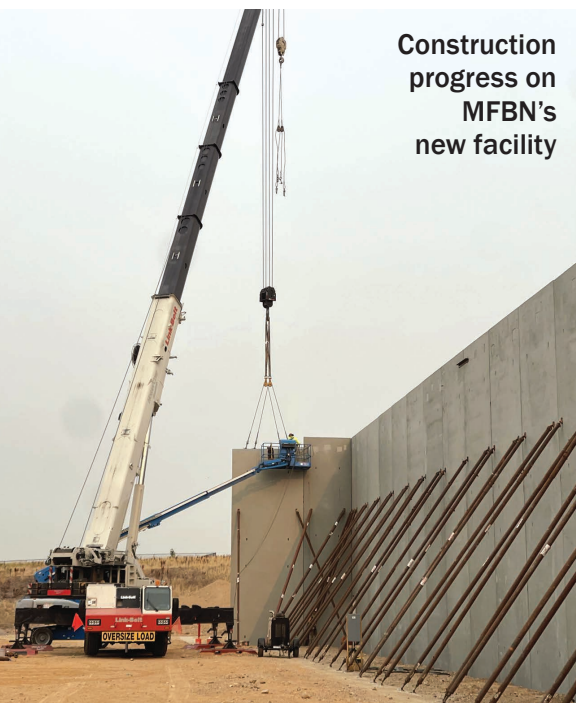
Construction progress on MFBN's new facility